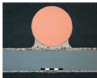
MTW before and after soldering